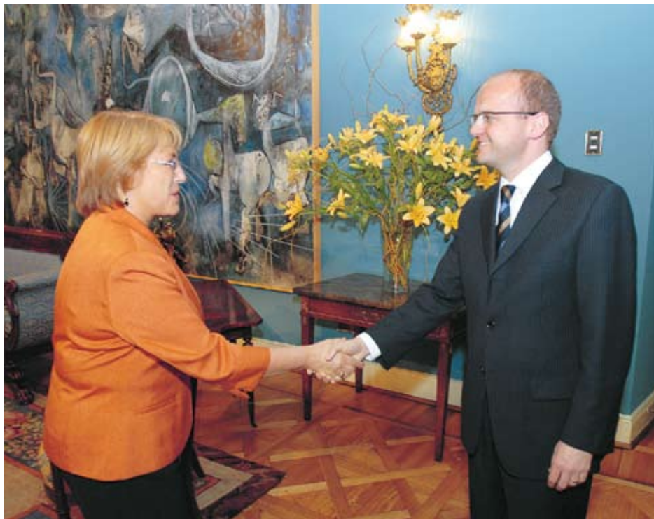
Chilean President Michelle Bachelet receives International IDEA's Secretary-General Vidar Helgesen at her office in Santiago, April 2006.

Dialogue with the aim of providing experiences and lessons learned of constitution building from around the world. Speakers from South Africa, Venezuela and Colombia attended the seminar.